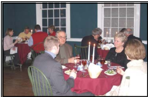
Guests enjoy dinner in the Thornhill mansion

by staff dressed in period clothing. Our park curator will give a brief historical introduction of the estate. Tickets are sold in advance and sell out quickly as we are limited to two sittings of 40. All proceeds are used to maintain the historic homes. We will begin accepting reservations in October at the Faust Park Visitor Center: (314)615-8FAU. Must be 21 years of age or older to attend.