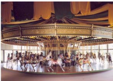
The St Louis Carousel and Sophia M Sachs Butterfly House