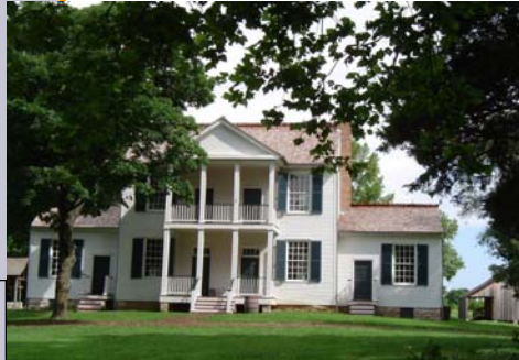
Thornhill is a classic Federal-style two-story home

May 8 and 9 Mother's Day Weekend 1:00 — 5:00 p.m. FREE