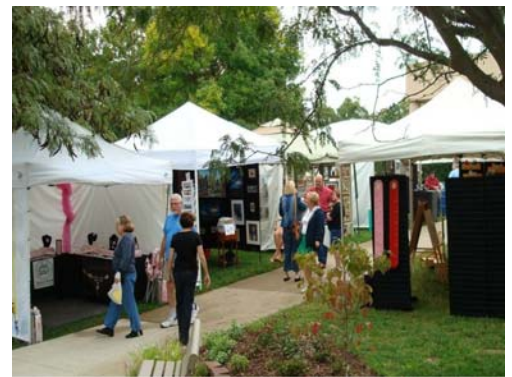
At the Fall Festival, demos of 19th century skills coexist with modern juried artists